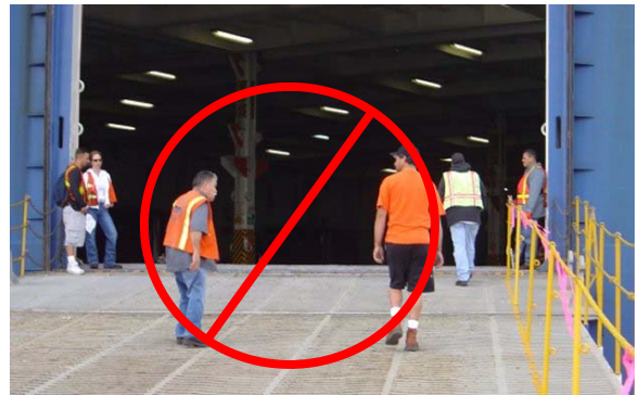
Use the designated walkways