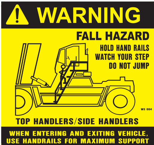
Decal # WS-004 6" x 6" FALL HAZARD labels are printed black on yellow, outdoor durable vinyl material with permanent adhesive.