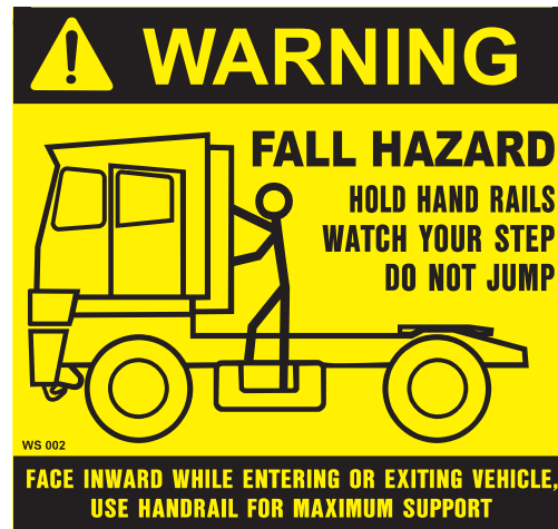
Decal # WS-002 6" x 6" FALL HAZARD labels are printed black on yellow, outdoor durable vinyl material with permanent adhesive.