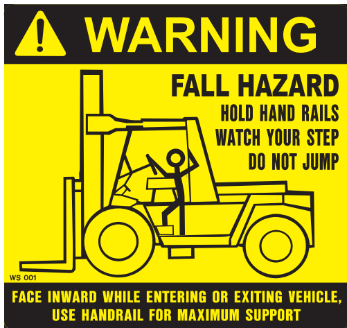
Decal # WS-001 6" x 6" FALL HAZARD labels are printed black on yellow, outdoor durable vinyl material with permanent adhesive.